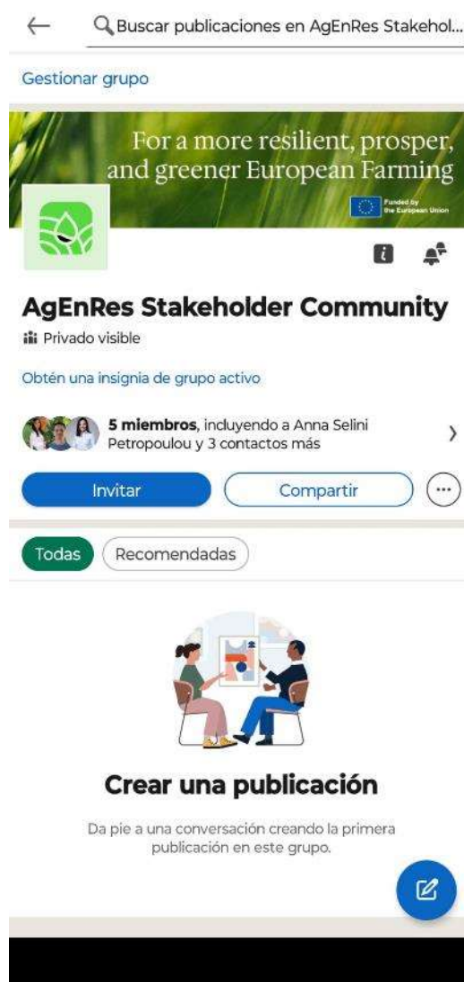
2. Figure - Accessing the AgEnRes Stakeholder Platform through the Mobile app of LinkedIn