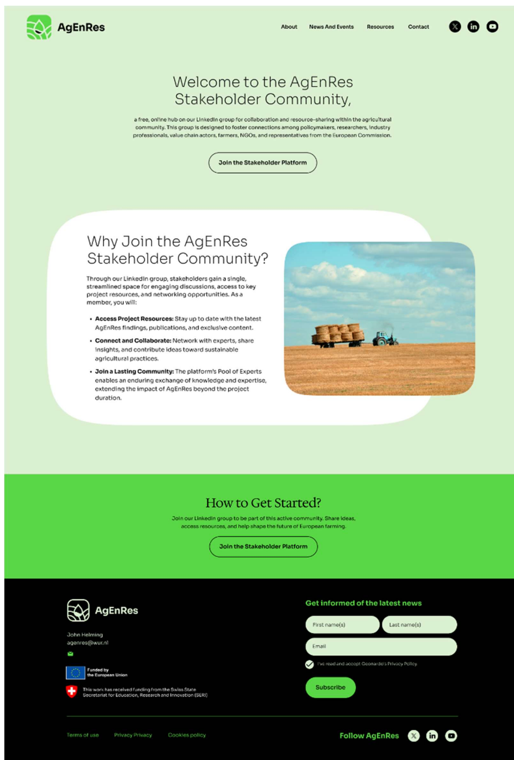
1. Figure - Mock up for the Stakeholder Platform Subpage on the AgEnRes Website

While the stakeholder platform will not be hosted directly on the website, a subpage will be created to provide easy access to the LinkedIn group. This subpage will explain the purpose of the platform and its benefits, helping boost cross-traffic between the website, social media channels, and the stakeholder platform. The integration will be completed by M12 (December 2024).